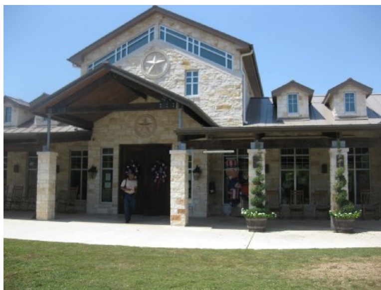
Warrior & Family Support Center Ft Sam Houston - see story on Pg 8