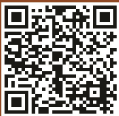
Assisted Living & Memory Care