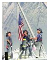
Remembering the victims and the sacrifice of 9/11/01